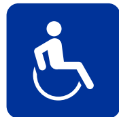
14. Handicapped (para discapacitados)