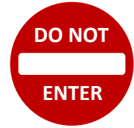
4. Do not enter (no entrar)