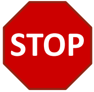
1. Stop (parar / alto)