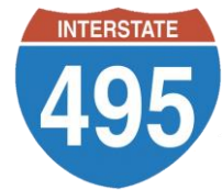
8. Interstate (carretera interestatal)