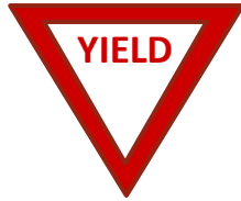
2. Yield (ceder el paso)