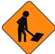
10. Construction (construcción)