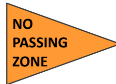
11. No passing (no pasar)