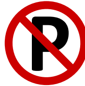
7. No parking (no estacionar)