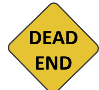
16. Dead end (callejón sin salida)