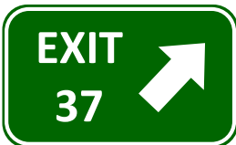
9. Exit (salida)