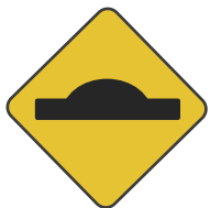
13. Speed bump (lomo de toro)