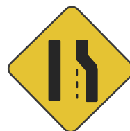
15. Lane ends (carril termina)