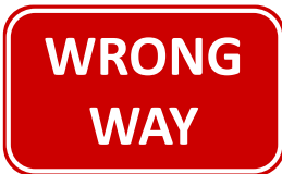
5. Wrong way (dirección equivocada)