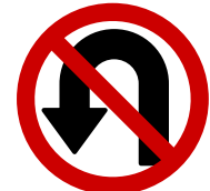
12. No U turn (no retornar)